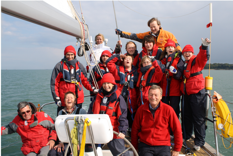
Welcome Hill Schools voyage

To date, Team Torbellino have raised over £10,000 which funds sailing adventures for young people. They have teamed up with Midlands based Welcome Hills School, and in May 2010 organised two voyages around the Solent. A total of 15 special needs students from the school were given the opportunity of a lifetime to experience offshore sailing.